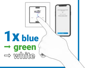
1x blue → green ⇒ white

Once you have integrated all ventilation units into the mesh, go to the control unit. Press and hold the grey fan icon until the LED lights up blue once . If the LED lights up green and then blinks white , the control unit has been successfully connected and will also appear in the app . If the LED lights up red, a connection could not be established. Try again by repeating this step.